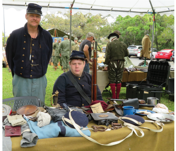
Re-enactors help bring Florida history to life during the annual Five Centuries event at the park.