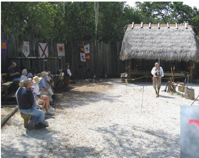
De Soto rangers and volunteers wear period clothing during their talks and demonstrations in Camp Uzita. The camp program brings history to life for park visitors.

De Soto National Memorial visitors will get a unique look into Spanish and American Indian life in the 16th Century at Camp Uzita.