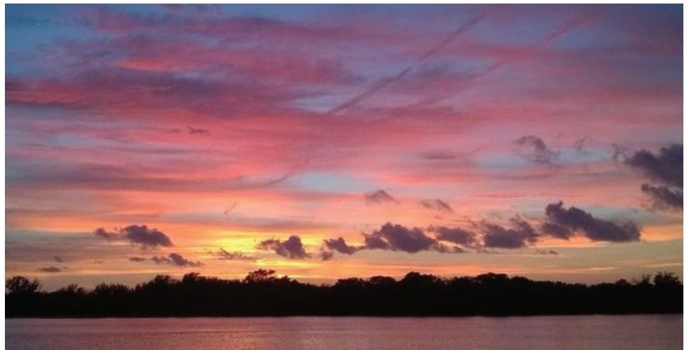
Share a colorful end of the day with Friends on a popular sunset cruise in May.

J oin Friends of De Soto Saturday, May 12, for a sunset cruise of beautiful Sarasota Bay with Paradise Boat Tours.